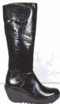
Fly London Yule Black Patent Wedge Boot, £135, at Annie & Boo, Holt.