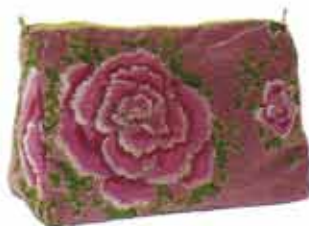
Cox & Cox Velvet Wash Bag, £22, at Vintage Home and Garden, Thornham.