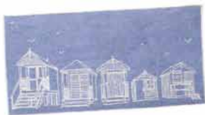
Perfect Day Beach Towel, £19.99, at Gone Crabbing, Burnham Market.