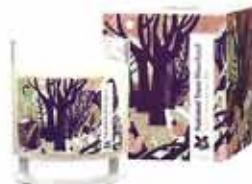
National Trust Woodland Scented Candle, £15, at Bakers and Larners.