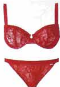
Autograph Lace Brief, £9.50; Autograph Lace Bra, £20, at Marks & Spencer.