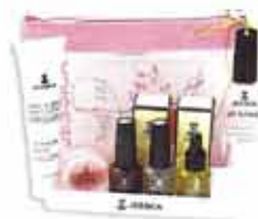
Jessica At Home Manicure Kit, £24.95, at Imagine Spa, King's Lynn.