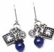
Swarovski Crystals and Pearls Charm Earrings, £17.95; Royal Blue Pearls with Silver Beads Necklace, £129.95, at Miglio, King's Lynn.