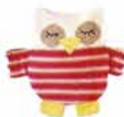
Owl Snuggle Hottie, £19.99, at Aldiss.