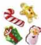
Assorted Christmas Bubble Bath Pouches, £2.50 each, at The Contemporary Home.